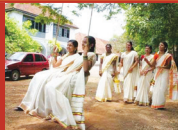
Types of Oonjaal